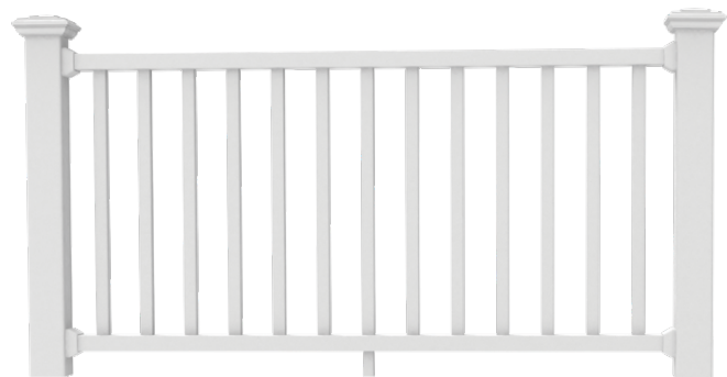
1 3/8" Square Balusters