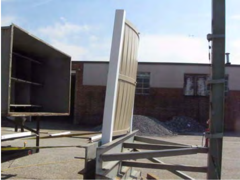
Photo No. 4 Cameron Fence Panel During Dynamic Wind Test