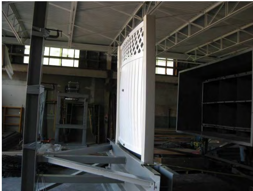
Photo No. 2 Dynamic Wind Test Setup - Halifax Fence Panel