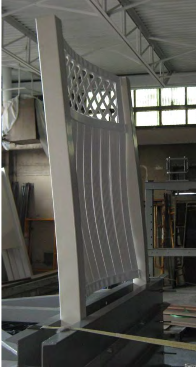
Photo No. 3 Halifax Fence Panel During Dynamic Wind Test