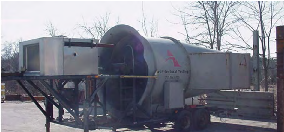
Photo No. 5 Wind Generator