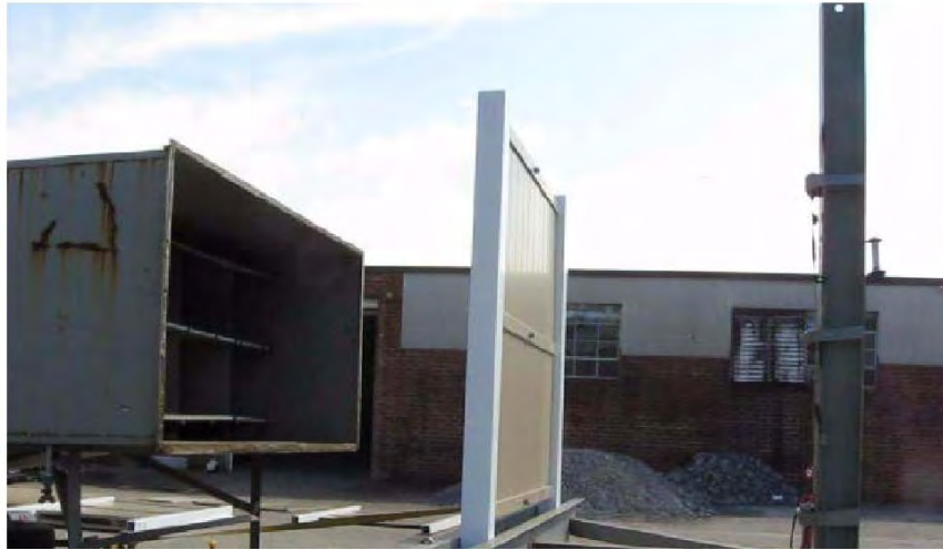
Photo No. 1 Dynamic Wind Test Setup - Cameron Fence Panel